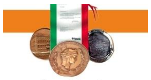
Evento pluri premiato con Medaglia d'Oro del Presidente della Repubblica Italiana dal Senato e dalla Camera dei Deputati